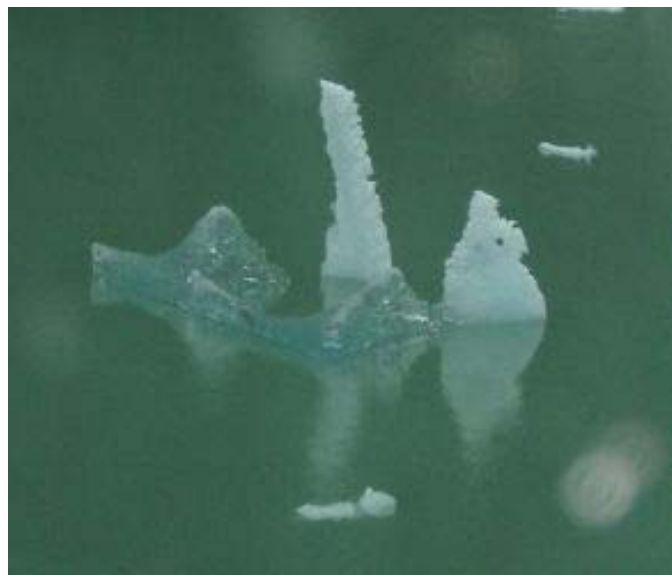
Icebergs – The Real Thing ! Photo from recent Alaskan cruise

May 2007 - Int'l Family Conference, Prague