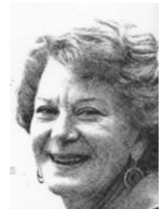
Virginia Satir 1916-1988