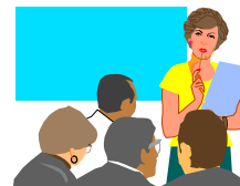
The main focus of the program was to build a community of leaders who would feel confident and competent & willing to provide a multitude of different Satir Model programs for professionals and the public.

I would say that the program was a huge success!