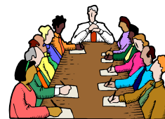
We now have a group of twelve Satir Institute members selected [for the Training For Trainers Program.]