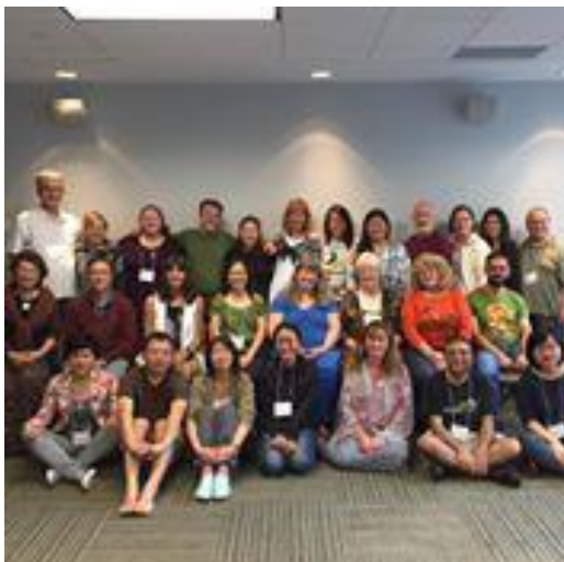
Level Three Participants