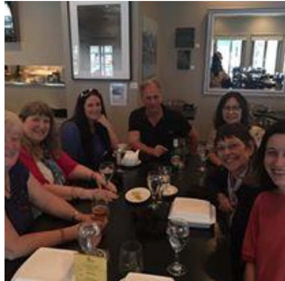
2016 Level One and Level Three Trainers and Supervisors