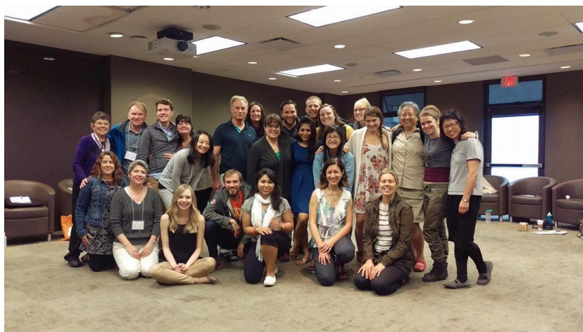
Level One Participants