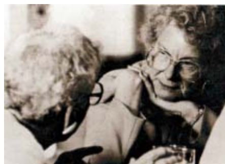
Healing the family we heal the world (Virginia Satir)

On the occasion of the 90th anniversary of the birthday of Virginia Satir, and the 20th Anniversary of the First International Congress on Family Therapy in Prague