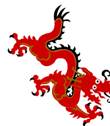
February marks the beginning of the Chinese New Year—the Year of the Dragon.