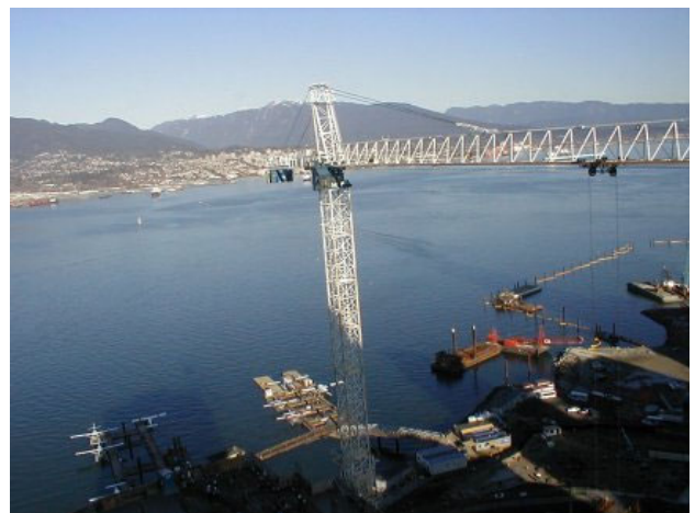
Vancouver harbour scene from window of recent SIP Board retreat