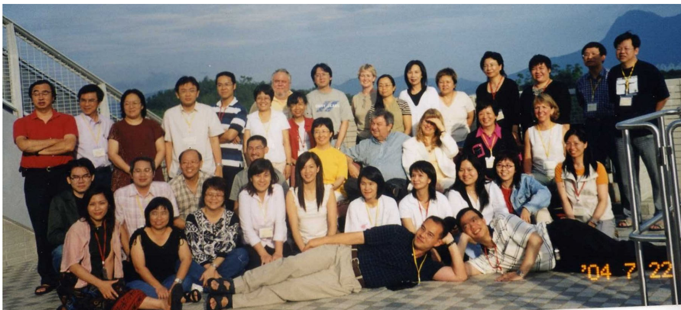
Satir Residential Training Group, Hong Kong, July 2004